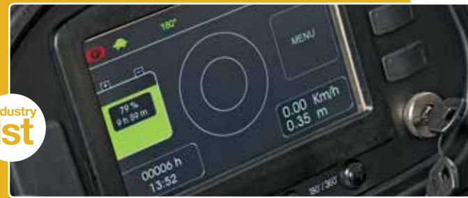
Premium touch screen display allows operators to be aware of the operational status at all times.