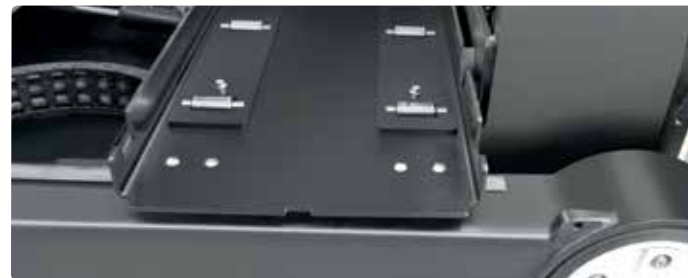
Side extraction battery system

A larger battery capacity and simpler battery change solutions keep your MR truck working harder for longer. The side extraction system enables rapid battery changeover, maximizing uptime and making battery changeover as easy as possible.