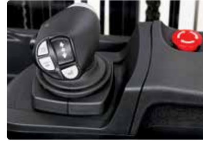
Optional joystick with integrated controls